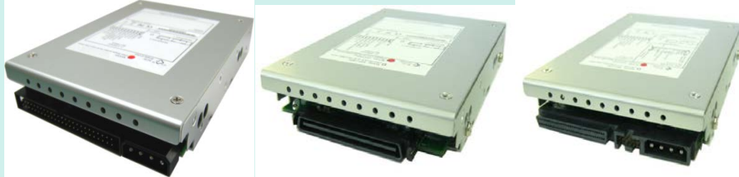
Narrow SCSI HDD 50pin

There are 3 line-up : For each interface -> Narrow(50Pin), SCA(80Pin), Wide(68Pin)